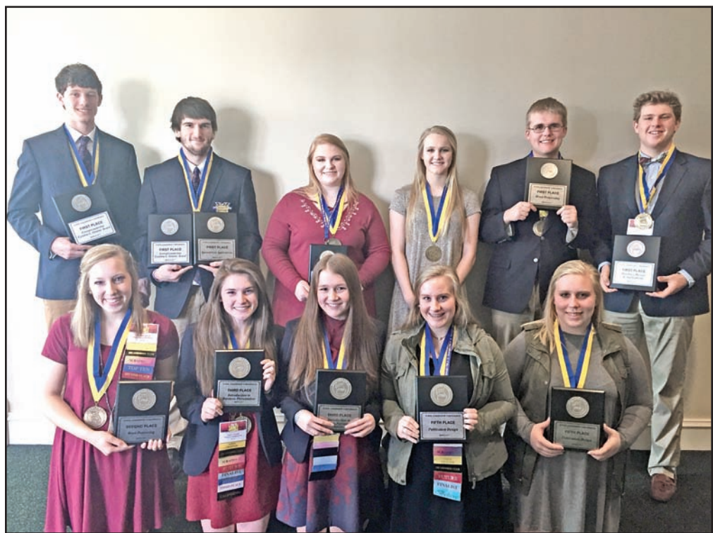
Towns County High School FBLA State Leadership Conference Winners