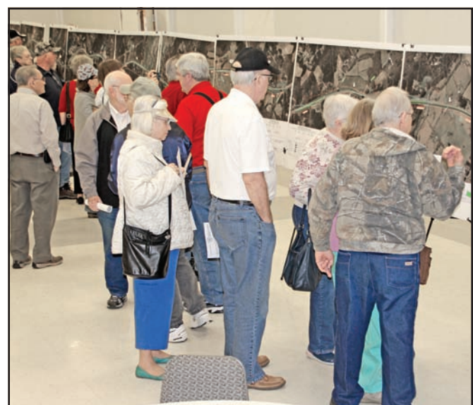
A recent GDOT Public Information Open House in Blairsville on Feb. 21.

designated project will cost around $100 million, and will widen SR 515/US 76